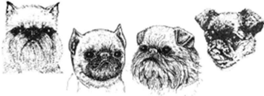
Rough, cropped ears Smooth, cropped ears Rough, natural ears Smooth, natural ears

The Brussels Griffon, or Griff, is a small toy dog, usually weighing between 5 - 15 pounds, though some have been bred to weigh up to 25 pounds.